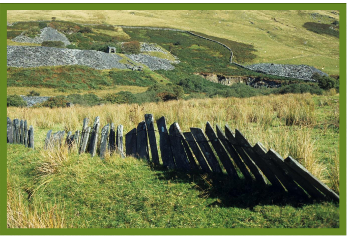
15B Incline and Winding House

The ACH project provides an opportunity for current and former members of the local community to share their own local heritage and knowledge of this landscape and to have a voice in shaping how World Heritage status might impact on it.